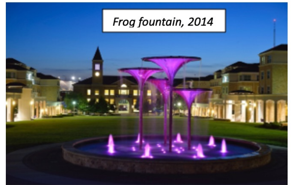
Frog fountain, 2014